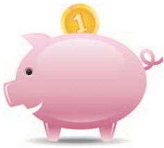
Cost to generate 1 Million btu of heat

Whoever thought doing something good for the environment would also save you money? It's true! A Rheem heat pump is built with the latest eco-friendly R410A refrigerant that operates more efficiently than R-22. But the most amazing aspect of a heat pump pool heater is its operating efficiency compared to gas heaters. A heat pump operates at 5 to 6 times the efficiency of a standard gas, oil or electric pool heater. If you live in an area where your natural or propane gas costs have outpaced your electricity costs, the savings can be big. The chart below illustrates just how much money can be saved using average energy cost data.