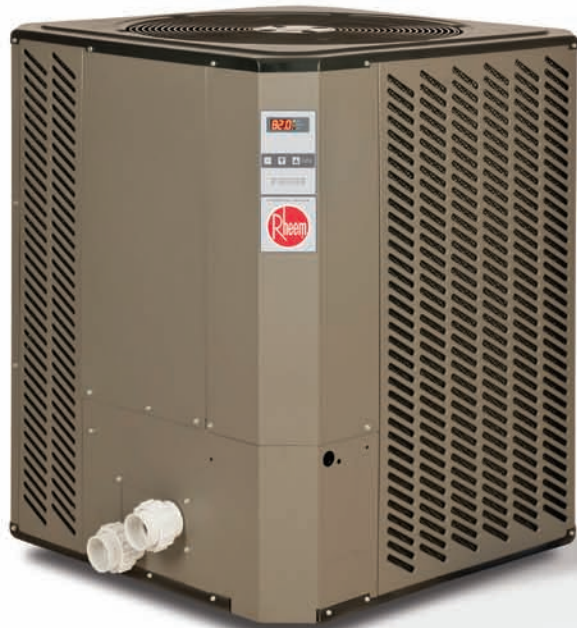
RHEEM DIGITAL POOL HEAT PUMP